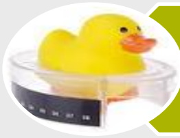
Bathtub Temperature Thermometer